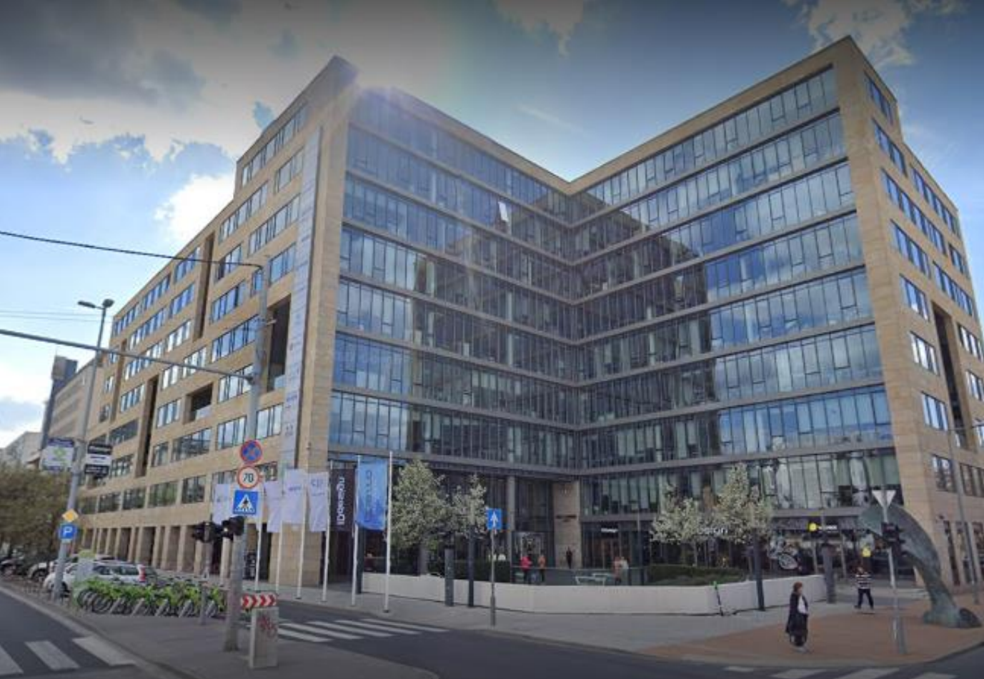
MVM CEEnergy Zrt. headquarters in Budapest